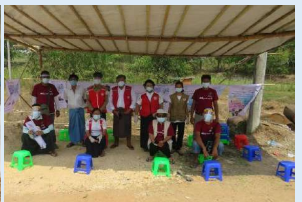
CSO members raised temporary shelters for testing camps.