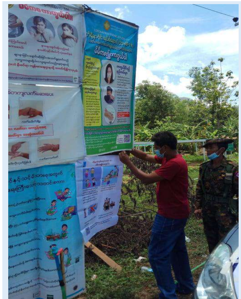
CSO members raising posters for COVID-19 at the center points together with military personnel.

The Civil Society Organizations also played a big role in this by providing their service as volunteers, raising awareness of the disease among the people through distribution of reading materials, using loud speakers and hand held speakers, posters and hand washing centers. Besides, showing the methods of making liquid soap, hand sanitizers by using available materials and making woven cloth masks. These demonstrations were taken in videos and distributed as widely as possible. At the same time, they developed guidelines for Community Based Facility Quarantine and Community Based Surveillance Guidelines and distributed them to at-risk