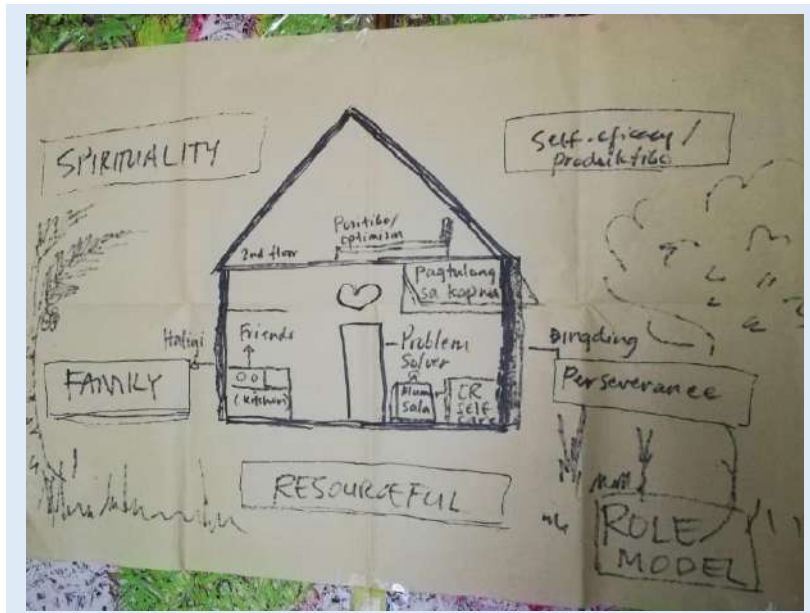
Output of MH-PSS.

The pandemic despite its sheer gloomy impact to many individuals, on the other hand, it provided some new discoveries in leadership and governance of states all over the world, also for family and community relationships in various localities. The spiritual nurturance and self-awareness of people became paramount in varied, unique settings. From the collection of feedback, there are good things that were brought about by the pandemic. One of the positive points that had happened is family togetherness and time for bonding that bring about closer and deeper appreciation of one another -- discovering their wonderful traits