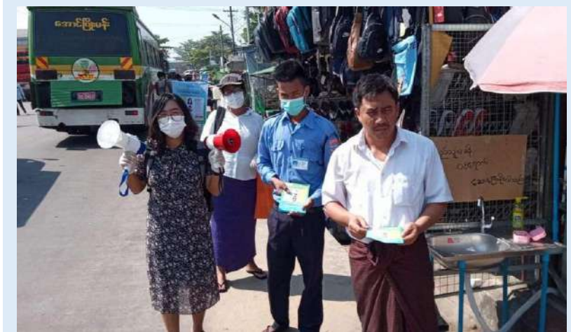
Awareness raising of COVID-19 by handheld speakers and pamphlets hand washing basins.

Since early January 2020, the Government of Myanmar has been proactively preparing to check the spread of COVID-19 pandemic in the country. Moreover, the infection situation is being closely monitored as Myanmar due to the country's proximity with China and a large volume of trade from it. The preparation included renovation of ICUs at the hospitals, conduction of awareness campaigns, issue of orders to prohibit local and foreign travellers and most importantly identification of suspected patients and provision of medical treatments, and upgrading of medical laboratories. Another important preparation was establishment of quarantine centers throughout the country in collaboration with the civil society organizations. State Counsellor Daw Aung San Suu Kyi mentioned during her daily video conferencing with stakeholders, that, success was achieved in preventive measures because early plans were adopted and it could be said that Myanmar was one of the countries which adopted rules and regulations at an early stage. Besides, she mentioned that, Myanmar Government holds the principles of "People are the key" and "Leave no one behind" and we experienced the