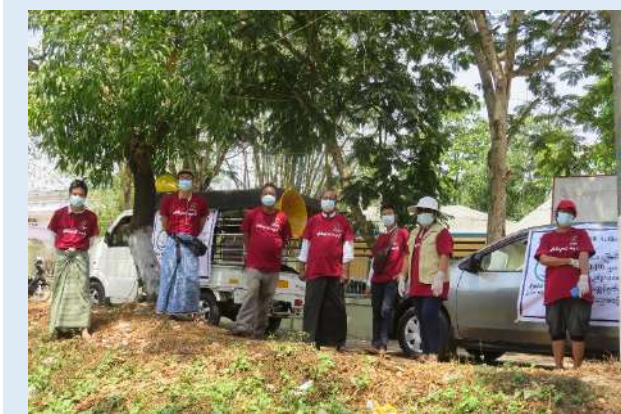
CSO members going around with vehicles for awareness raising of COVID -19 in the sub-urban areas.

In Myanmar there was almost no infection inside the country but it was carried by the people who came back from Foreign Countries. The first case was found from 2 people on March 23 who came back from England and the United States. Again, most of the infection cases in