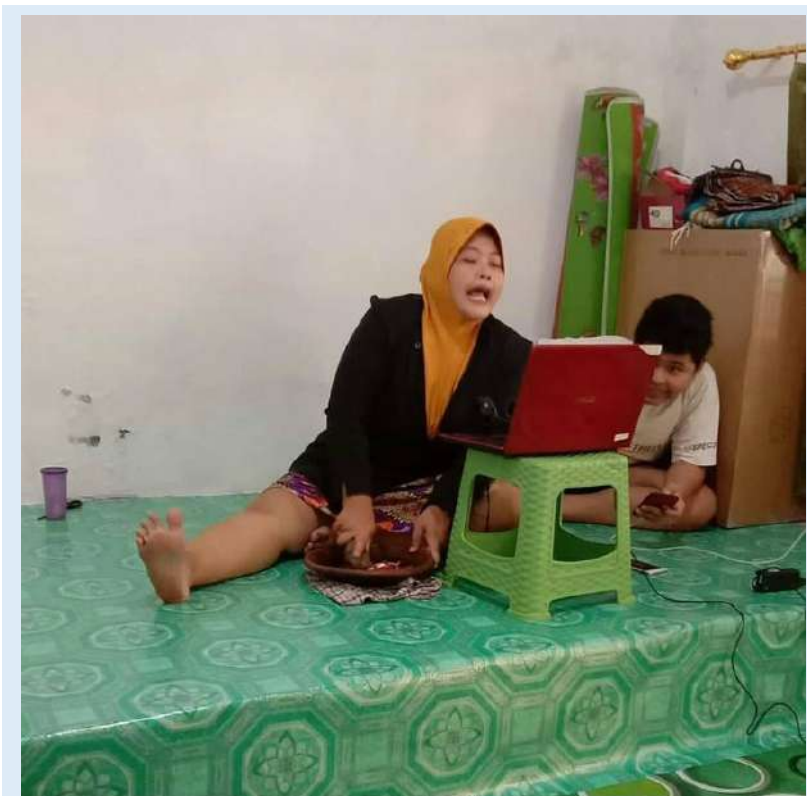
A mother has a virtual meeting while cooking some food during Work from Home (WFH) regulation.

In the implementation of large social distancing (PSBB) due to Covid-19 pandemic in some areas in Indonesia, many companies also have implemented working from home (WFH) regulation for their employees. WFH might be beneficial for some, but it is considered as