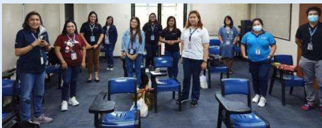
Happy Faces after the MH-PSS session.

CDP does the MH-PSS in a non-threatening, lighter approach and process for about two hours either face to face but observing physical distancing or via online. In the course of the intervention, the participants get to identify what they want to do to be helpful to the affected people and communities, cull resilient statements and frame shared/articulated statements into resilient attributes that provides hope and resilience for the participants. An example of a statement from the participants would be like 'this will turn around for the best'. The resilient attribute that may be culled from such statement is optimism wherein the