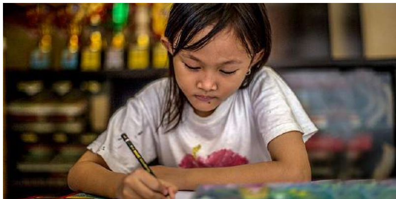
Students can learn at home while schools are closed because of the COVID-19 pandemic.

By Mihir R. Bhatt, All India Disaster Mitigation Institute