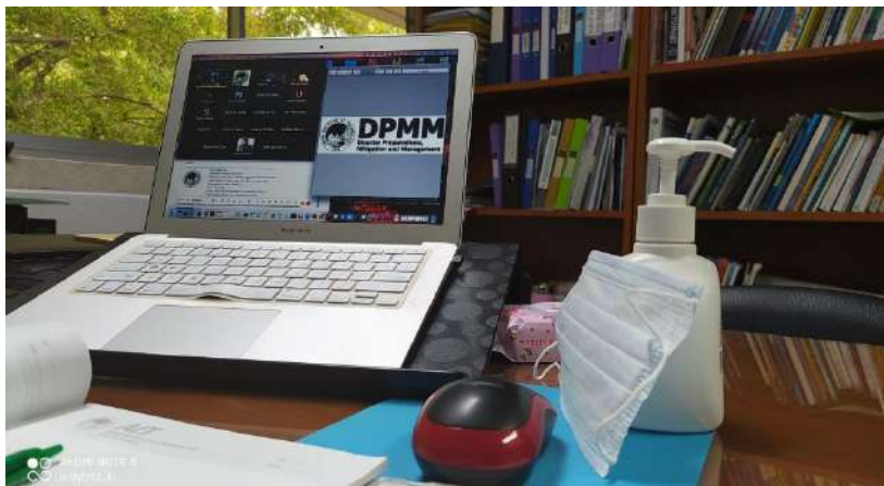
New normal of Education and learning.

The COVID-19 crisis has provided the opportunities to develop a more flexible, resilient and blended platform for teaching and learning. Flexible curricula and blended learning options might provide the students access to a diverse set of curriculums or modules that opens endless opportunities for them to acquire additional knowledge in their unique areas of interest. However, the universities need to evaluate their institution’s approach to blended learning, identify gaps and improve blended learning strategies. Developing key infrastructure to support blended learning is essential for transitioning the traditional higher education system to more flexible and versatile blended or hybrid learning, which will help for the education continuity during the COVID-19 crisis, as well as other natural and anthropogenic hazards. ■