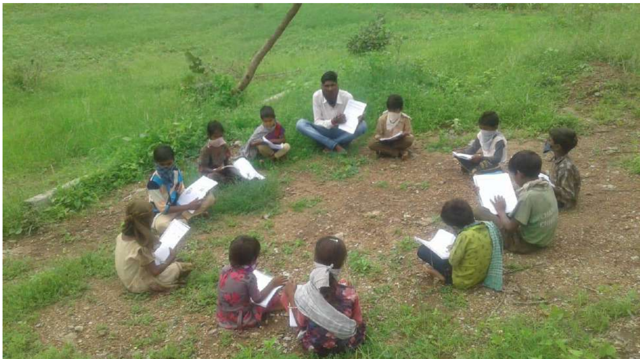
Village Khampa - PACE.

Though, the online learning solutions have been provided, there were certain challenges to this - the huge digital divide with only 8 % of families with children in school going age group having access to both smart phone /computer and internet facilities as per NSSO data, with livelihood losses making recharging phones and internet services difficult. Moreover, the field interactions 4 with the children and their parents suggest that children found online content very difficult to reach and stress inducing as learning has become increasingly difficult with online solutions, due to challenges in access to devices like smart phone or laptop as well as internet connectivity, further, understanding the lessons as well as the standard language used in the online sessions was found to be very hard and more importantly the