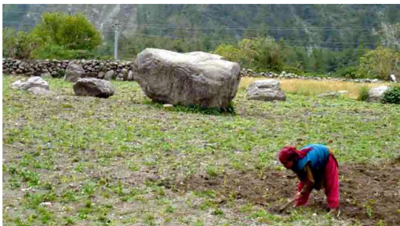
Marginalized agricultural practice and sedimentation in cultivated land making more vulnerable to Disaster

Agriculture Practice: Agriculture sector contributes nearly 35% of the Nepal's GDP and supports the livelihood of more than 74% of Nepal's Population (NLSS, 2007 and CBS, 2012). Only about 25% of Nepal's surface area is suitable for agriculture purpose. About 21% of the land is cultivable of which 54% has irrigation facilities (MoAD, 2012) and remaining is the rain fed. The agriculture practice is governed and guided by rainfall and totally dependent on climate. Due to increasing population, safe land is scarce and people are occupying marginal lands for their livelihood