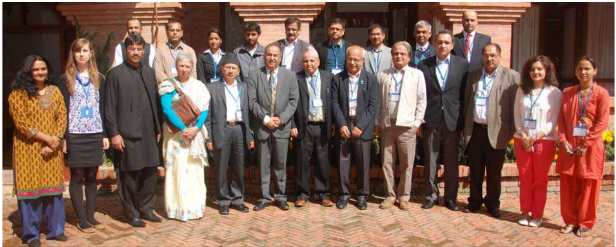
Participants of HFA2 Roundtable discussion held in October, 2015, Kathmandu.

thereby increasing susceptibility to different types of hazards.