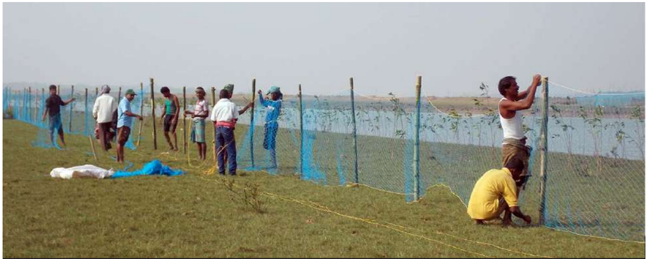
Fencing to plantation site by community members of Chakamohanpur village, Kendrapada District, Odisha.

integrated coastal zone management) have been shown interest to promote mangroves, particularly in coastal Odisha. Under this, various activities have been undertaken such as restoration and afforestation of mangroves, generating awareness about various benefits of mangrove ecosystems, enhancing other rural livelihood opportunities, etc.