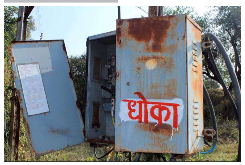
Hazard hotspot: Electric DP.

were organized especially for village youths. Concepts and correlation between Hazard, Vulnerability, Exposure and Capacity were thoroughly explained through these training. A village level Disaster Management committee (VDMC) was formed as subcommittee of gramsabha. All further activities were planned through this committee.