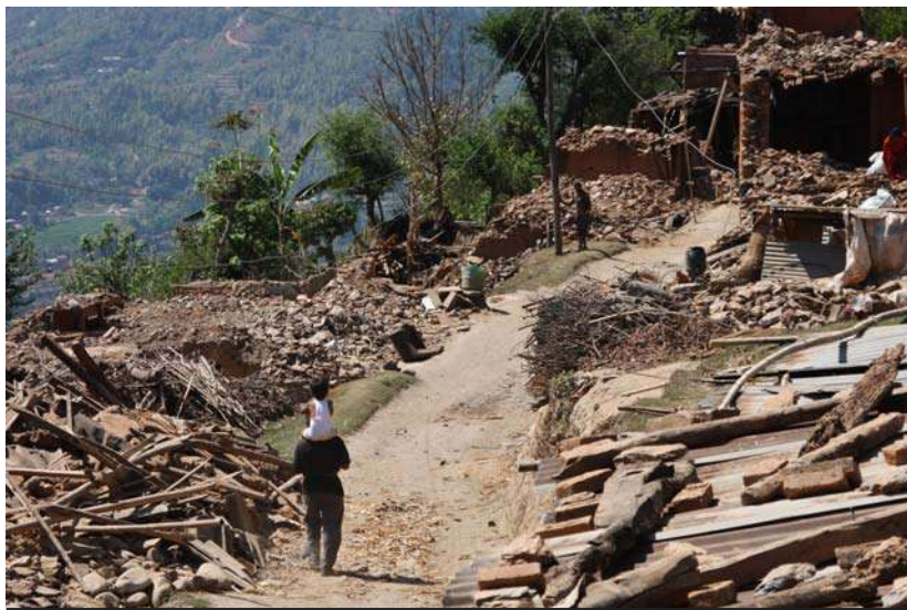
Nepal Earthquake Affected Village in Karve District.

services for Disaster Risk Reduction and also provide food, safe water and medicine etc.