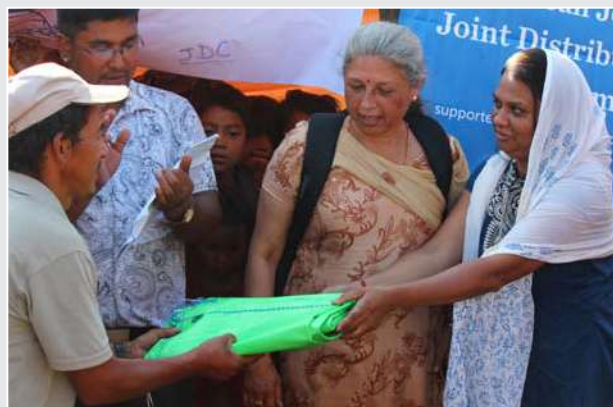
Distribution in Bhumli Chowk VDC.