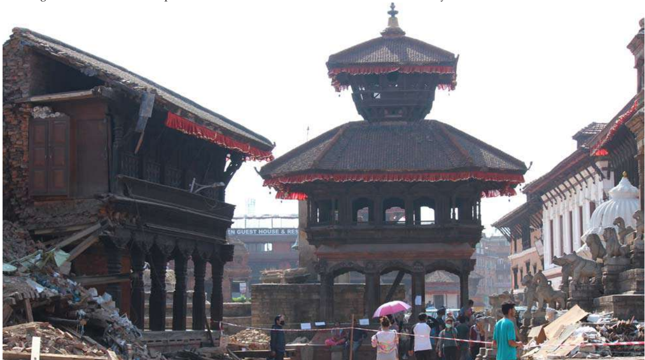
Damaged heritage site at Bhaktapur Darbar square .