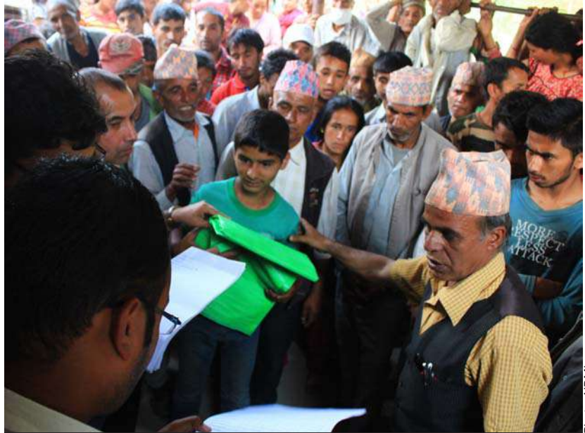
Relief distribution at Sudal village.

Resources were mobilized and the relief materials were procured from India and got delivered to