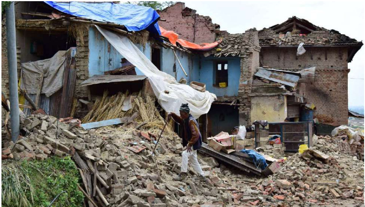
Damaged houses at Sudal village in Bhaktapur district, Nepal.