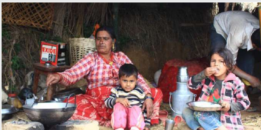
A family in temporary shelter at Sudal village.