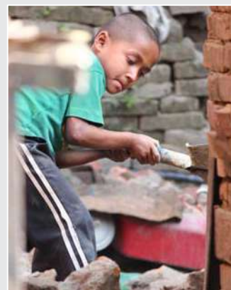
Small boy removing debris in Bhaktapur town.

Do you wish to receive this publication regularly? Write to AIDMI ( bestteam@aidmi.org ). The publication will be sent by E-mail. Your comments help southasiadisasters.net remain an effective and informative resource for regional issues of disaster risk management. Please contribute comments, features, reports, discussion points, and essays about your work. Today!