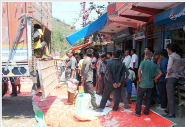
Unloading & sorting of material at Fisling before distribution.