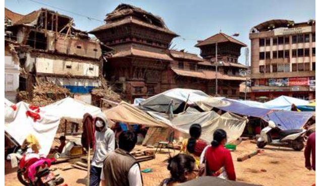
"The powerful earthquake that hit Nepal on 25 April 2015 is a painful reminder of the region's vulnerability to devastating disasters. Lessons from this tragedy will be used through the World Humanitarian Summit South and Central Asia regional consultation to improve future humanitarian action."

The global humanitarian aid system is undergoing close scrutiny to seek ways to improve on its delivery to people affected by conflict and disasters. Listening to the actors, traditional and non-traditional is part of the process that will culminate in the World Humanitarian Summit (WHS) in Istanbul in 2016. Tajikistan is preparing to host the South and Central Asia World Humanitarian Summit regional consultation which takes place at the end of July 2015.