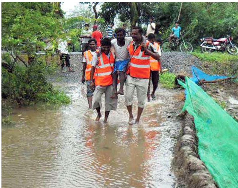
Shelter level task force members evacuating differently abled person to Koithakala shelter in Bhadrak district during Cyclone Phailin.

The much talked about change in terms of community resilience that was in the lime light, was the difference in the results of two similar forms of Cyclones i.e., "Super Cyclone (1999)" and "Cyclone Phailin (2013)". The communities in Odisha have showcased their ability to respond, withstand and recover from the