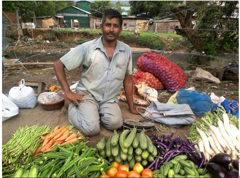
A local vegetable market in Ulubari area of Guwahati where street vegetable vendors are doing their business.

Vending) Act, 2014: It is an act of the Parliament of India, which was enacted to regulate street vendors in Public areas and protect their rights. It was introduced in Loksabha on September 2013 and by Rajya Sabha on 19th February 2014. It received assent by the President on 4th March 2014. The bill came into Action on May 1, 2015. This bill provides social security to the street vendors, regulation of urban street vending or incidental thereto.