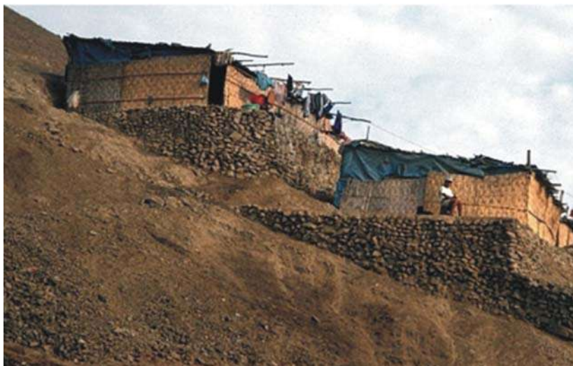
Newcomers in Lima, Peru, construct unstable terraces on dangerous slopes in the outskirts of the city, as no other land is accessible to them.

– Theo Schilderman , Head of Practical Action's Infrastructure Programme, UK