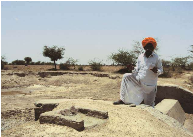
What Biphur needed was water conservation. Hence, rainwater harvesting structures were built, such as the boundary wall here which was made with clay around fields so the water does not run off.

number of rainy days, heavier precipitation, higher run-off and insufficient recharge of the water tables.