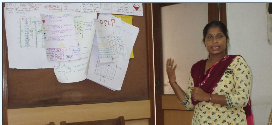
A participant explained her expectation from the workshop in Ahmedabad, Gujarat.