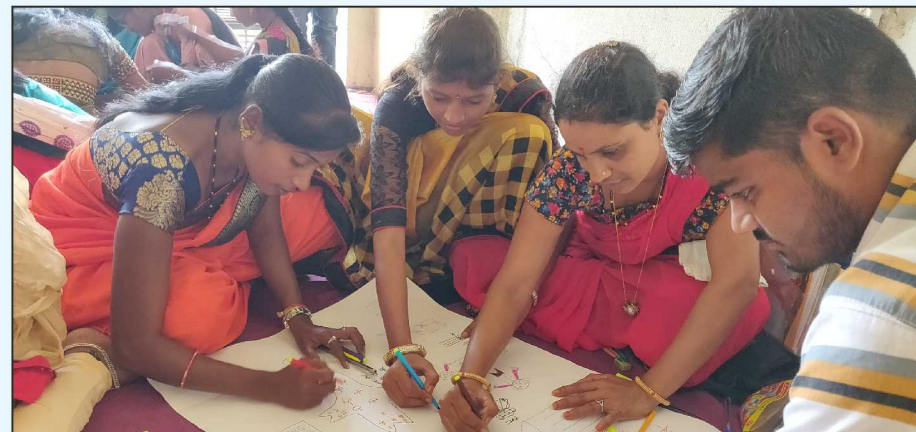
Lateral Learning Process underway during the training, Kinwat, Aurangabad, Maharashtra, September 2022.

covering 40 villages of Kashmir and 20 villages of Ladakh enlisting key resilience actions.